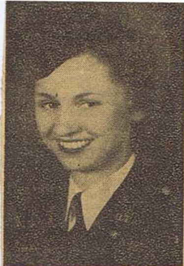
Flying Nurse Helps